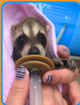
Baby Raccoon from Critter Litters