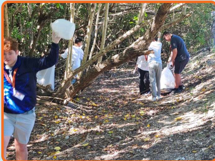
Students collecting trash around trees