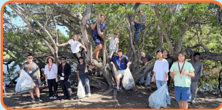
Students gathering to clean up trash for Community Clean Day